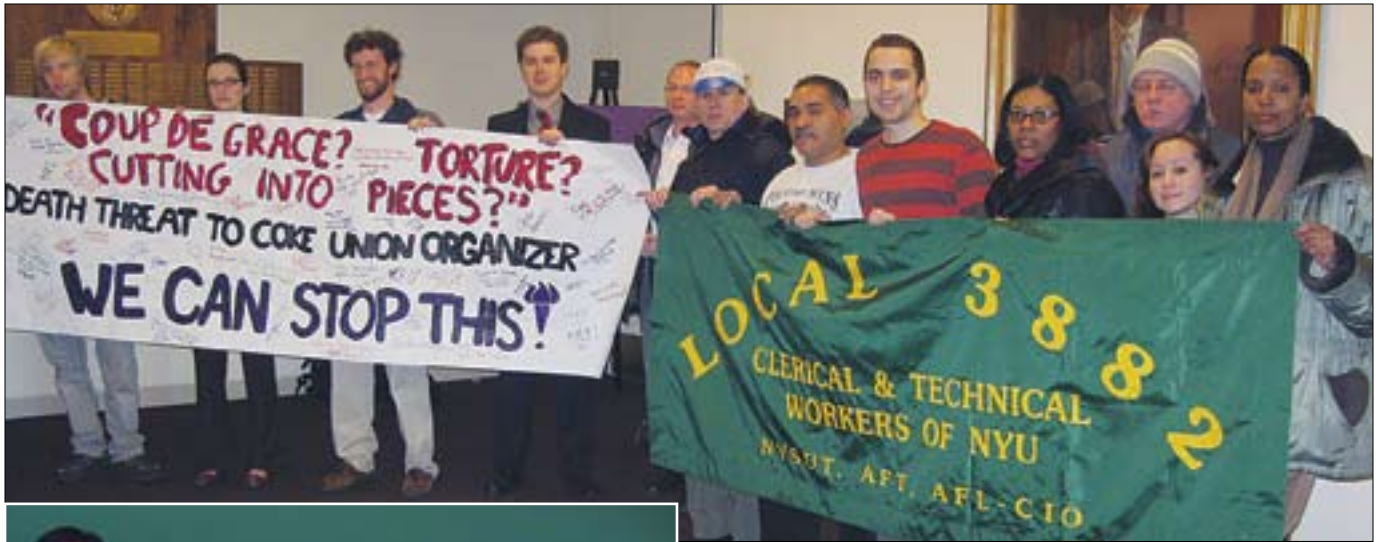
Above: UCATS members joined student supporters of Coke ban outside University Senate meeting on February 5.